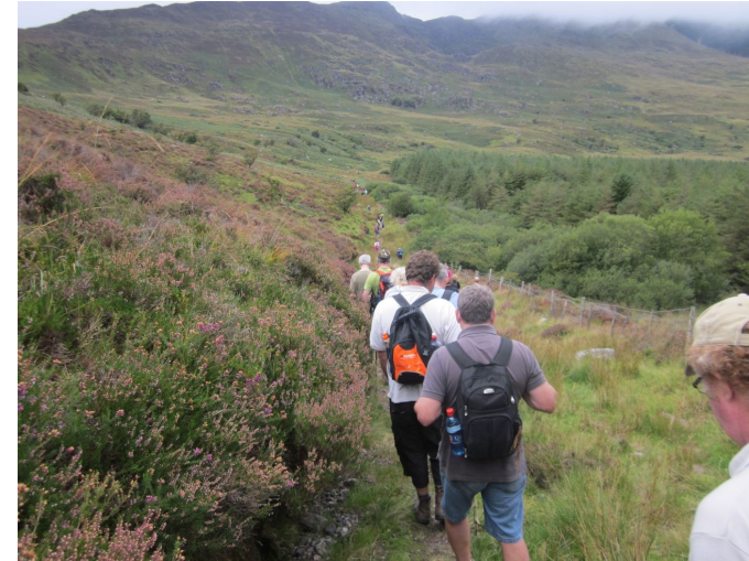
Under the Gap on the Bearna Walk.

17km sponsored walk in aid of Diabetes Ireland, crossing the Comeragh Mountains in Co. Waterford.